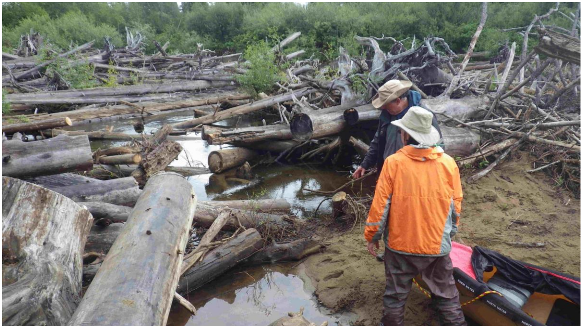
MISERY - Madeline W.